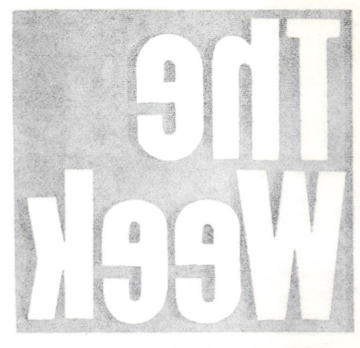
A NEWS ANALYSIS FOR SOCIALISTS Vol. 5, No. 9, 3rd March, 1966